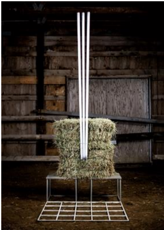
LeWitt + Flavin Tower 2014. Found metal, wood, hay, and fluorescent bulbs. 122 x 49 x 66 IN.

Schaming's work at Residency 108 is inventive in construction and range. Pipe Dream Tower , 72 x 38 x 32 inches, is a triangular corral of wooden horizontal slats fencing in a herd of black vertical pipe insulation. The contrast between lighter-hued flat horizontal lines and dark vertical tube shapes is as interesting as the title. Upspout Tower , 66 x 74 x 25 inches, shows a ladder top down but open, forming a sideways V as other wood and metal parts frame two white gutter spouts forming r-shaped white diagonal volumes on top. Other constructions feature white pool umbrellas, fencing, chairs, siding, fans; a cement mixer turns into a form for Plantain Tower . The LeWitt + Flavin Tower sports hay, metal, side tables, and long (unlit) fluorescent bulbs.