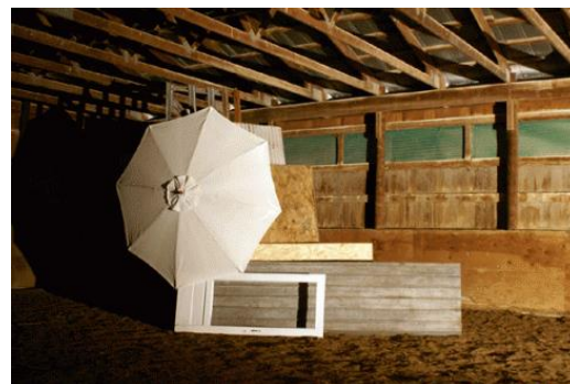
Brooch Tower 2014 Found wood, metal & umbrella