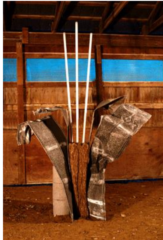
Brugmansia Tower 2014 Found cement, metal, insulation and fluorescent bulbs 124 x 84 x 47