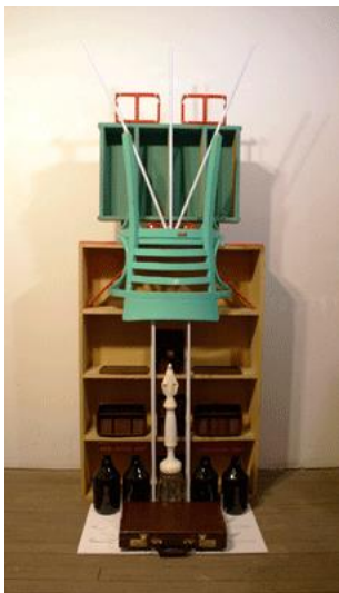
Mother Mary Tower, 2014. Avon; Tupperware; found wood, plastic, paper, metal and glass. 83 x 33 x 30 IN.