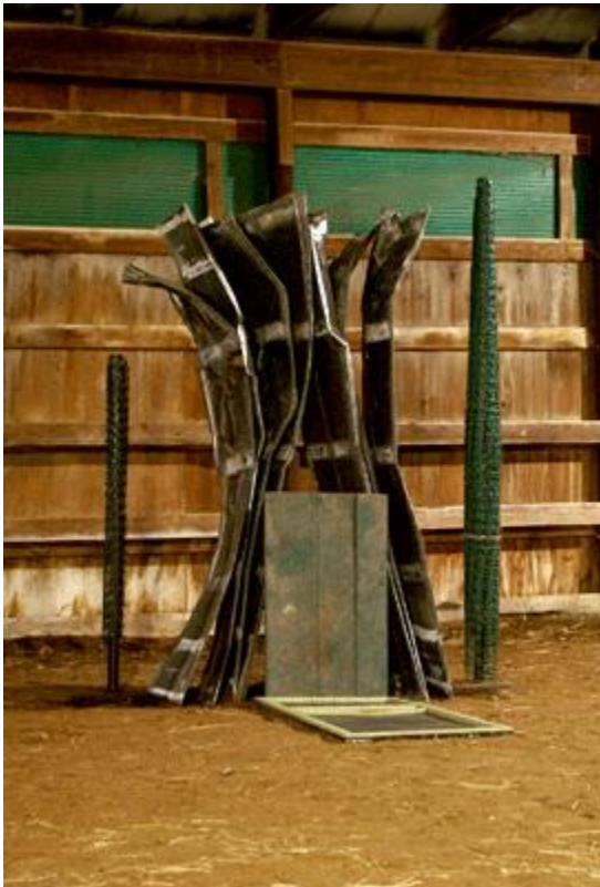
Intersection Tower, 2014 Found wood, metal, plastic with tape 93 x 83 x 93

For more information: www.residency108.org and www.WadeSchaming.com